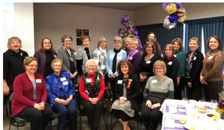
(Just a few of the committee members)